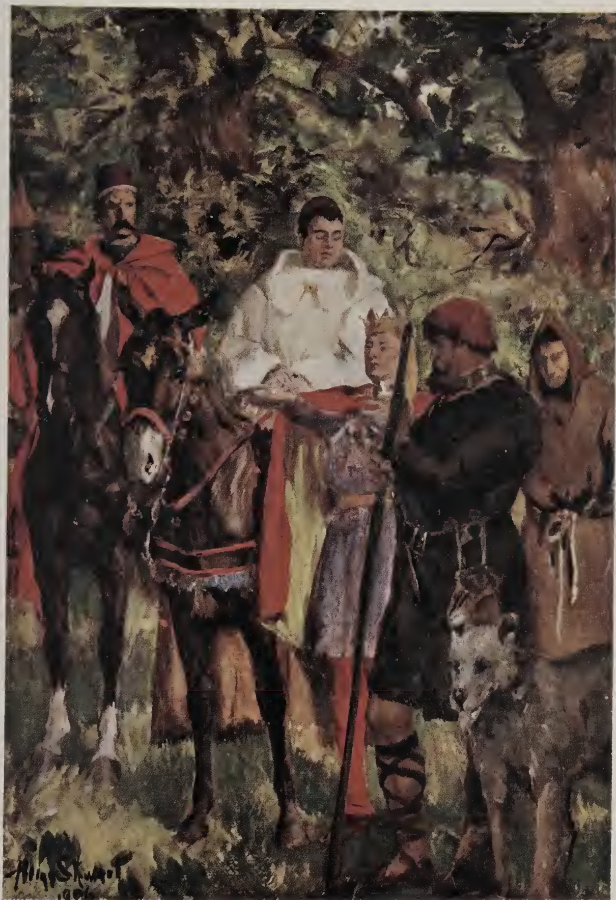
"NOW BY ALL THE SAINTS"—BEGAN THE BISHOP.